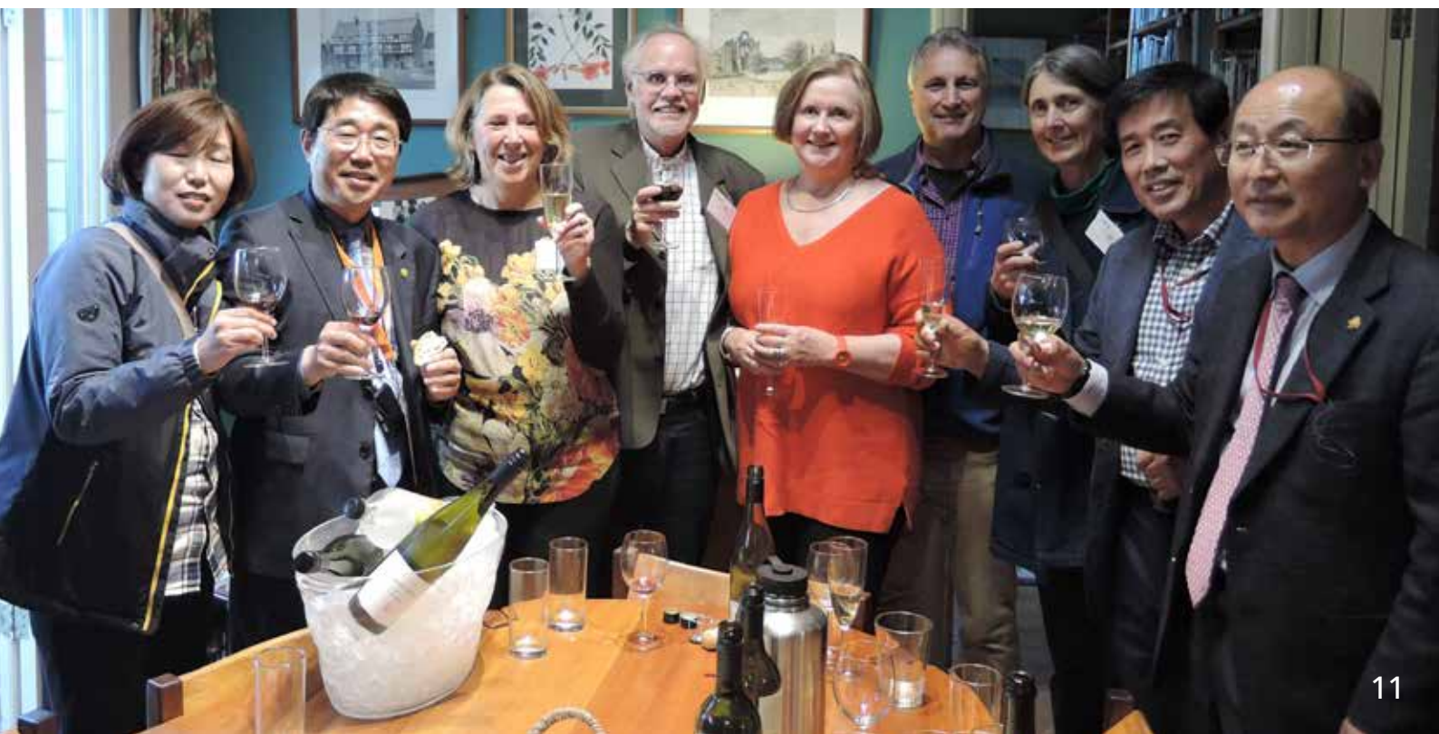
Korean Cittaslow visit Katoomba

As NSW's first 'City of the Arts' and being within a World Heritage setting, environmental concerns and community involvements became key to being awarded a 2017 Jeonju (South Korea) 'World Slowness Award' as an internationally recognized 'slow town' of distinction. Being two hours outside of Sydney, our slow way of life (plus tele-commuting) has become ever more enviable for those that appreciate Cittaslow qualities.