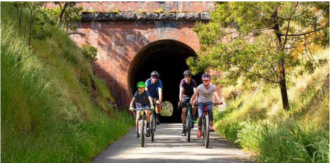
Yea: a friendly country town within a beautiful agricultural region with rail trails.

May your town become the next Cittaslow?