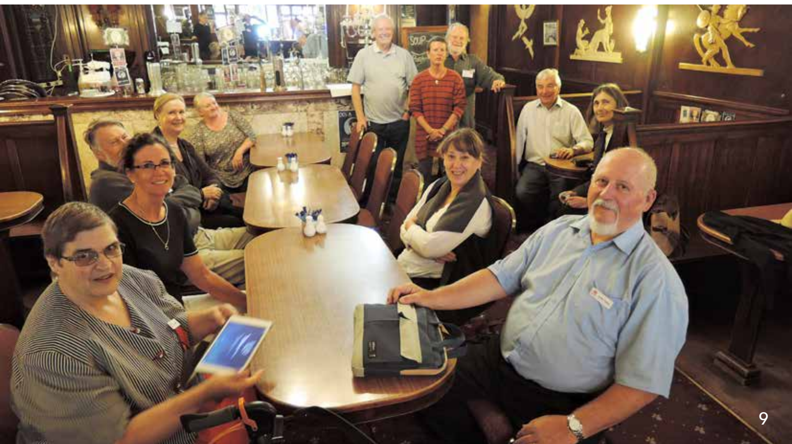
Cittaslow Australasia at The Paragon Cafe Katoomba

SO LET'S CONNECT – join our Australasian Cittaslow network.