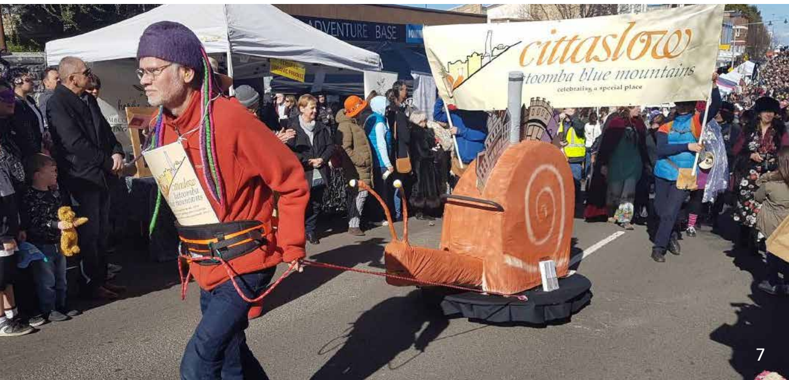
The annual Katoomba Winter Magic street parade snail