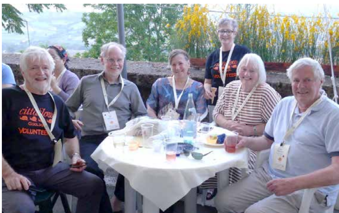
The Australian contingent (all three towns) at the Cittaslow International Assembly in Orvieto Italy, June 2019.

How long should this all take? Maybe three to six months . We have learnt that the longer it takes the harder it becomes to maintain focus and commitment. So that is why we have realistically streamlined the process.